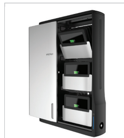
Tablet Charging Wall Mount 12