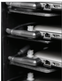
Right Angle Adapter Kit A8087963 (sold separately)

Dell recommends that customers dispose of used computer hardware, including monitors, in an environmentally sound manner. Potential methods include reuse of parts or whole products and recycling of product, components and/or materials. For more information, please visit http://dell.com/recycling_programs and www.dell.com/environment