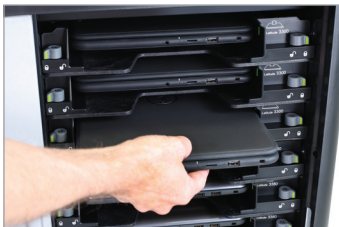
Optional docking kits simplify cable connection to select Dell laptops